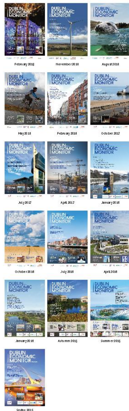
Figure 1: covers of DEM issues 1-16

The event format has evolved from a static presentation to involve more insights into specific elements of the monitor. The introduction of a Panel discussion format as also proved very popular and engaging as it offers the opportunity for additional insights into expert opinion as well as audience participation through Q & A.